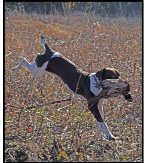
GCF&G Photo by: Toni Dobbs

CHECKOUT OUR WEBSITE AT: WWW.GCFNG.COM FOR ADDITIONAL DATES.